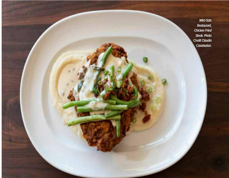
Wild Oats Restaurant, Chicken Fried Steak.

Wild Oats opened an indoor/outdoor outpost in the Heights as part of the Houston Farmer's Market multi-million dollar renovation. Chef Nick Venado's menu is full of everything that makes Texas great - Mexican, Tex-Mex, Southern and German flavors are all represented. Texas cocktails and mouth-watering desserts are also part of the casual dining experience. wildoatshouston.com